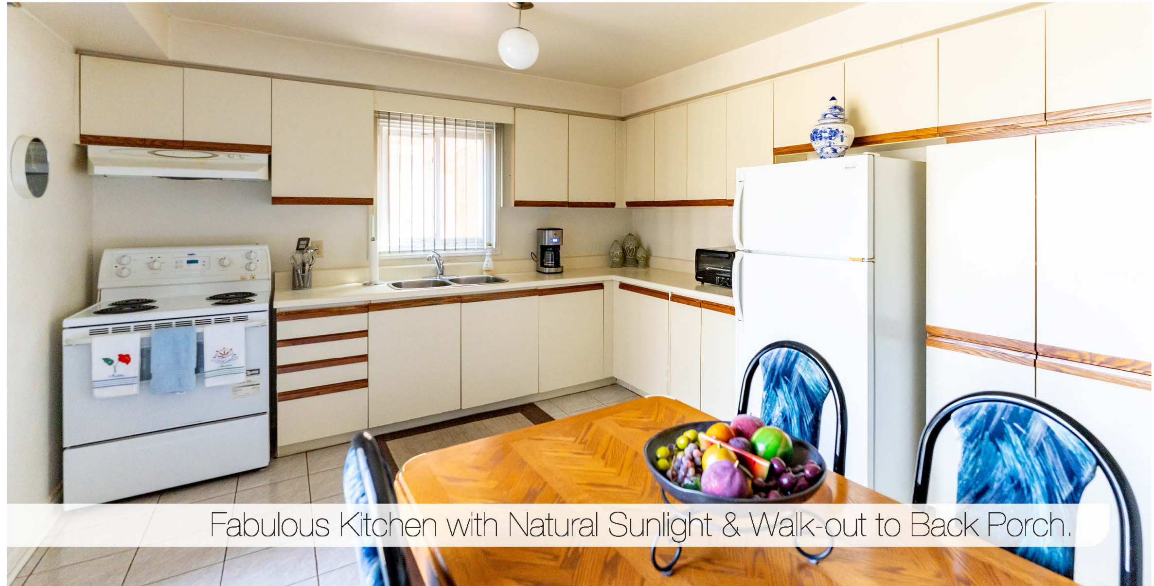
Fabulous Kitchen with Natural Sunlight & Walk-out to Back Porch.