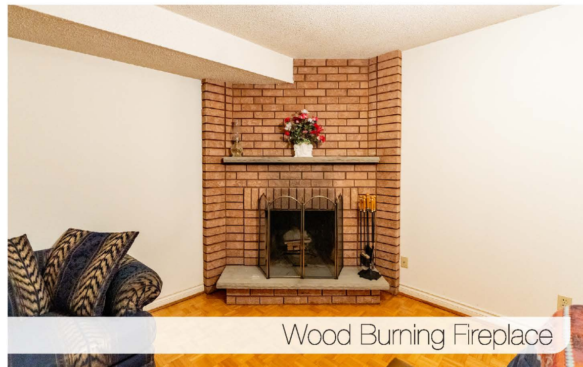
Wood Burning Fireplace